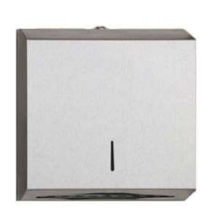
Reference: 14.102 AISI 304 stainless steel bright or satin