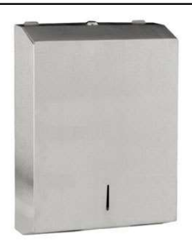
Reference: 14.103 AISI 304 stainless steel bright or satin