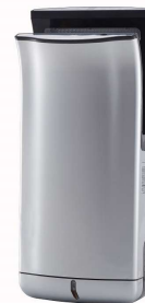
Reference: 11.112 silver grey