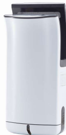
Reference: 11.111 white